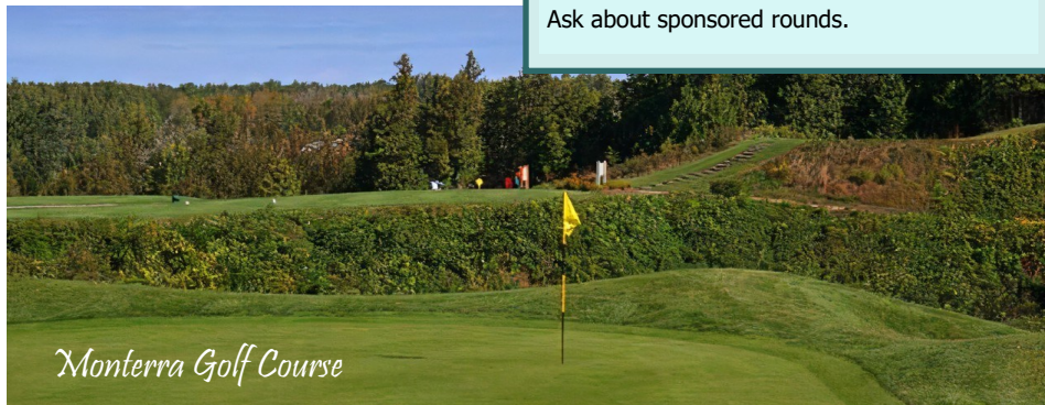
Monterra Golf Course